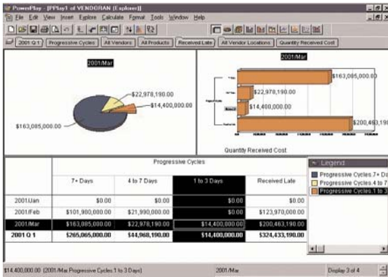
Vendor delivery stats instantly indicate which vendors are delivering on time and which are running behind.